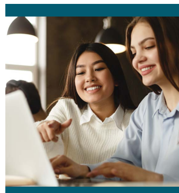
Online Writing Instruction Tool

WriteToLearn provides ELLs with the opportunity to focus on fundamental writing skills, while improving reading comprehension and expanding their academic vocabulary.