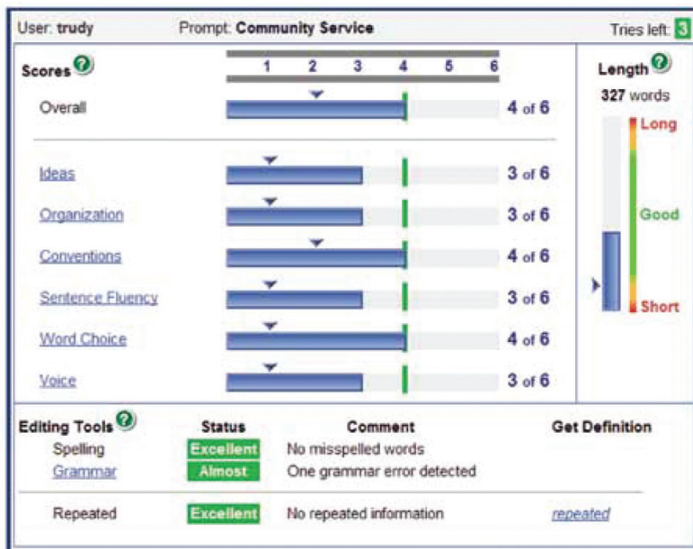
Figure 3: Intelligent Essay Assessor Student Feedback Screen. Offers feedback that includes an overall holistic score, 6 traits of writing, as well as spelling, grammar and redundancy.