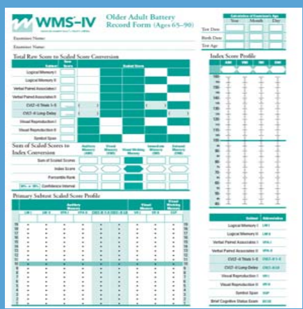
Example of WMS-IV Scoring Summary Page