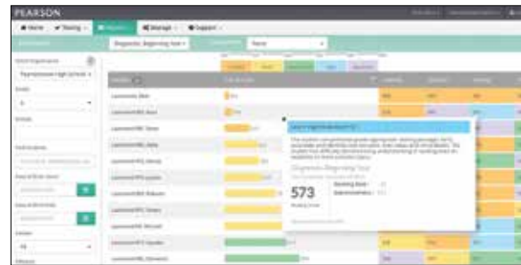
Select any student's domain score to see a performance description for that proficiency level, subskill scores within the domain, and the percentage of test questions the student answered.